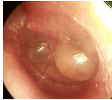
The picture on right shows an infected ear.